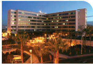
Long Beach Medical Center

For more than a century, Long Beach Medical Center has been dedicated to providing quality care to the community. In