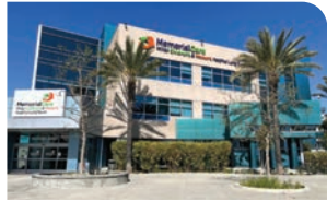
Miller Children's & Women's Hospital

addition, Miller Children's & Women's Hospital is the only hospital in Los Angeles and Orange counties where both expectant mothers and their babies can receive advanced and critical care under one roof. This convenient and rare